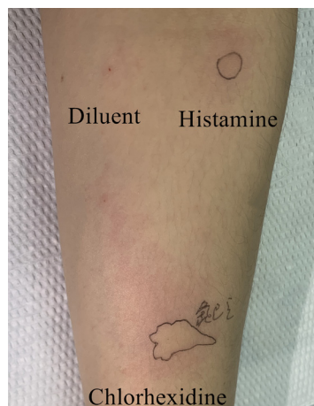
Figure 1. Positive result of the skin prick test for chlorhexidine (5 mg/ml)

Abbreviations: SPT, skin prick test; IDT, intradermal test; PPL, penicilloyl-poly-L-lysine; MD, minor determinant; ND, not done PPL and MD were from Diater Laboratory, Madrid, Spain.