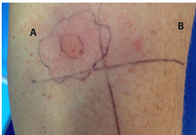
Figure 1. Positivity of intradermal test (IDT) [side A] and skin prick test (SPT) [side B] with THC.

She was referred to our Allergy Unit. An allergological work-up, including skin prick tests (SPTs), intradermal tests (IDTs), BAT with diclofenac and THC, was timed for 6 weeks after reaction to minimize the risk of false-negative results after receiving patient's written consent. SPTs were performed with undiluted diclofenac (25 mg/ml) and thiocolchicoside (2 mg/ml) with saline as the only excipient. After 20 minutes, we observed a positive reaction to THC (mean wheal 20 mm) [Figure 1].