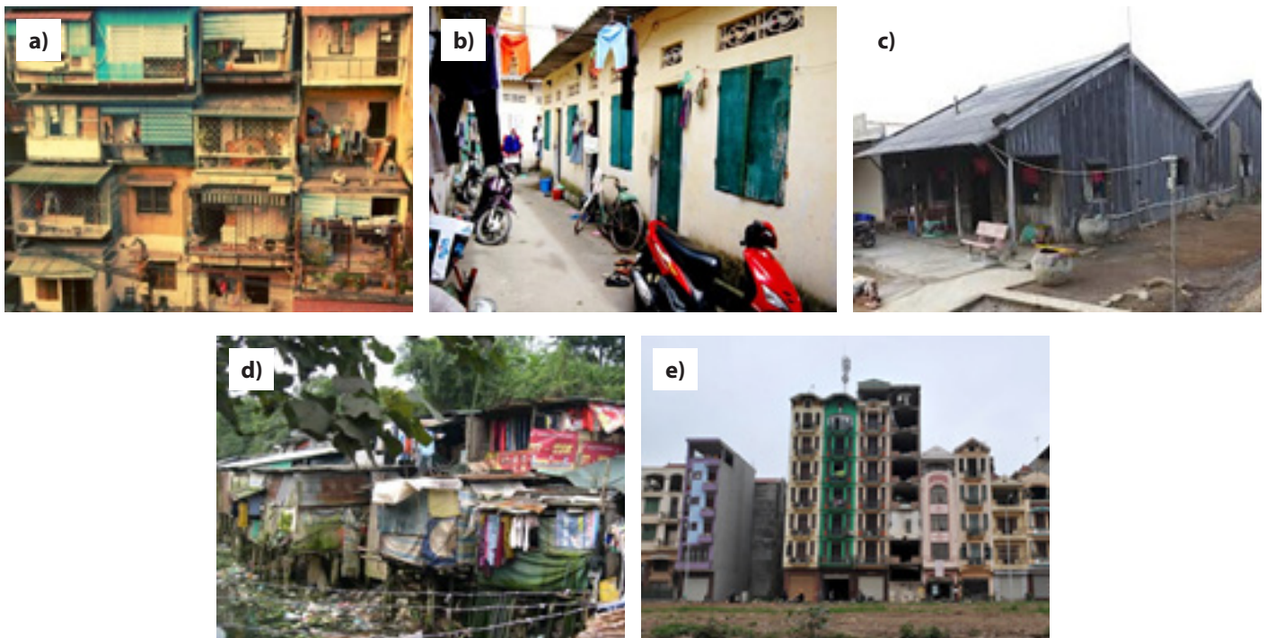
Supplement Figure 1. Photograph of the 5 typical house types in Ho Chi Minh City: a) apartment, b) rental house, c) rural house, d) slum house and e) tube house. The rental house is a small room with poor ventilation, ground on floor, kitchen in the main room. It has one small main door. Some rental houses do not have windows. It usually presents in urban and sub-urban districts

Several factors related to indoor air and house characteristics were obtained by questionnaire and inspection of each house. The questionnaire included environmental characteristics of house, number of inhabitants and indoor activities. The questions were developed on the base of the factors identified in the literature.